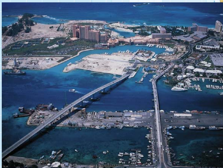
262 m. (Grand Bahamas Harbor)